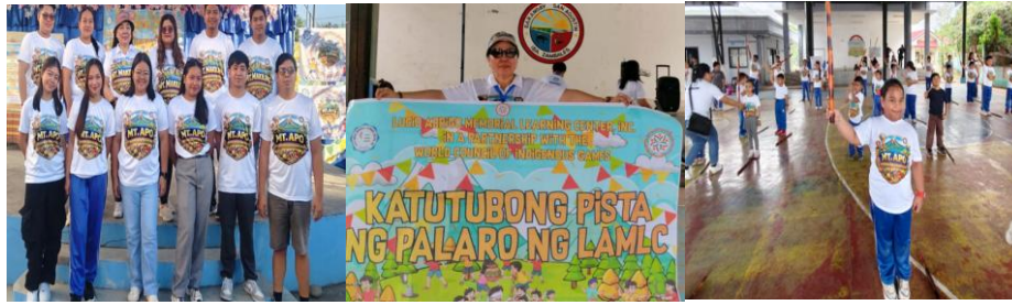
Caption: Participants and organizers during the 1st South East Asia Indigenous Games 2026 promoting cultural exchange, youth engagement, regional cooperation, and sustainable sporting practices, Philippines, January 2026.