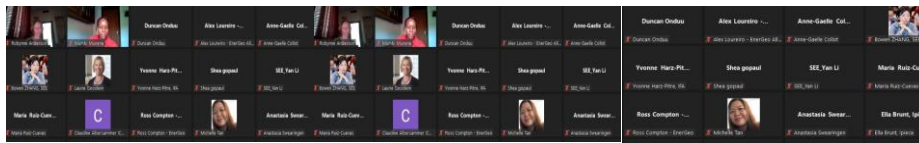
Caption: Screenshot from an international webinar featuring global participants discussing Indigenous knowledge systems, climate adaptation, and environmental resilience, Online International Event, January 2026.